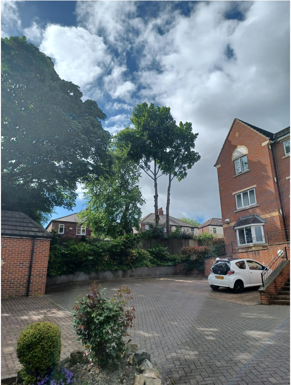
Image showing inexperienced pruning of the sycamore to the right of the tree.