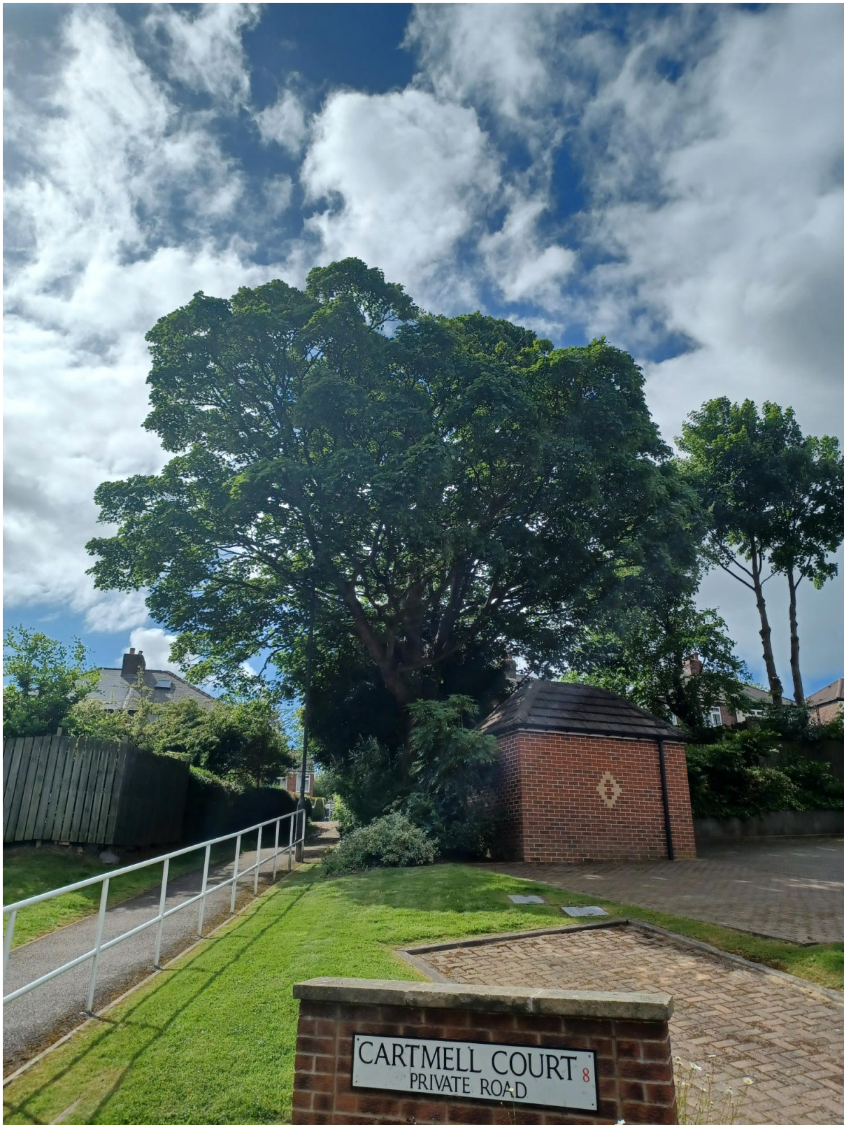
Image of tree shown facing south. The footpath joins Cartmell Hill with Todwick Road