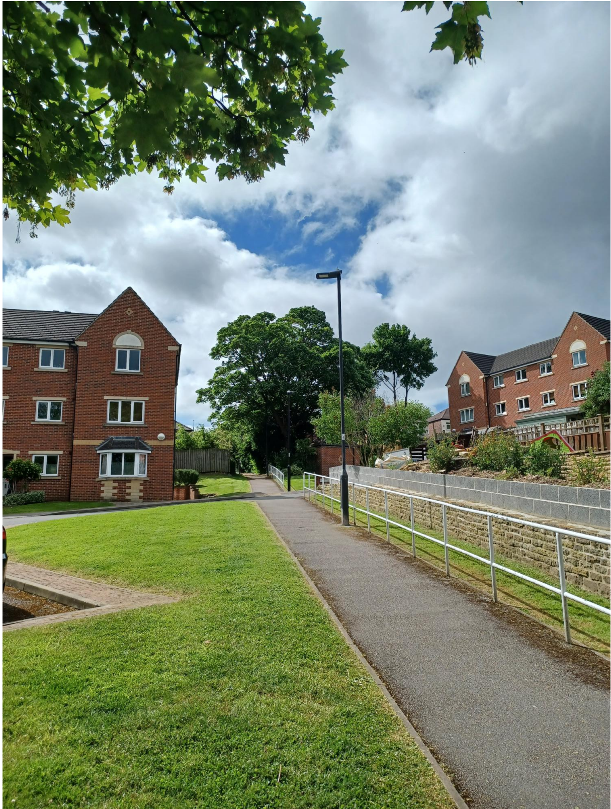
Image showing the tree from the bottom of the Cartmell Hill estate, overlooked by two flat complexes.